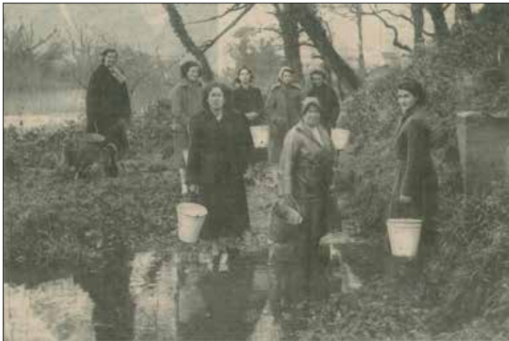
published in Donegal Free Press, 24 February 1999

Look at the below photograph. What do you think is going on? What decade might it be from? Do you notice anything about the gender of the people in the photo? Do you know anyone who collected water from the well in her youth?