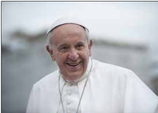
Pope Francis in St Peter's Square